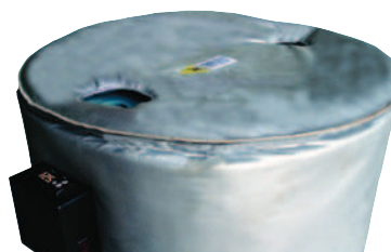
Insulation Cover with openings for bung hole and vent