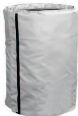
55 Gallon Drum Full Coverage Insulation Blanket