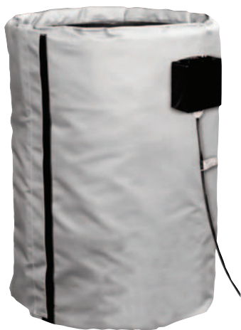
55 Gallon Single Zone Full Coverage