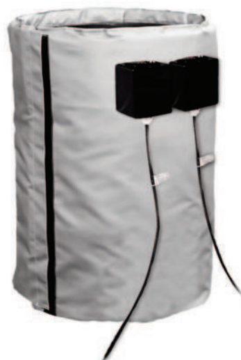
55 Gallon Dual Zone Full Coverage

Dual Zone Drum Blanket Heaters include two independently controlled and wired heater sections for better uniformity, control and higher wattage.